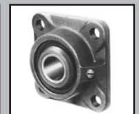
Link-Belt® Flange and Pillow Block Bearings