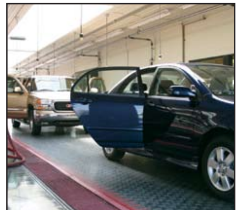
Rexnord 6995 (Solid Top) MatTop chain for car care produces a wide, durable smooth conveying floor