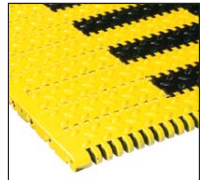
Rexnord® 6999 (Safety Top) MatTop® Chain for Car Care Conveying