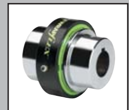
Falk™ Wrapflex Couplings