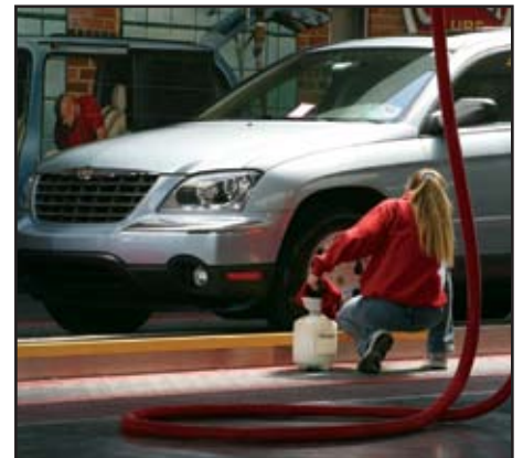
Rexnord 6999 (Safety Top) MatTop chain for car care enhances worker safety and increases car detailing efficiencies

In car care operations, a constant, uninterrupted flow of vehicles through the wash tunnel is the best guarantee of success. With few mechanical parts and an innovative chain drive design, Rexnord 6990 Series MatTop chains for car care are basically maintenance free. Less downtime, plus quick and easy maintenance, means lower operating costs for your car care enterprise