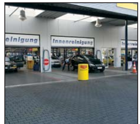
Rexnord MatTop chain for car care in a high capacity interior detailing operation conveying vehicles and people for increased productivity.