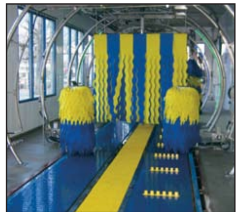
Rexnord 30 in wide 6995 Solid Top MatTop® chain with T1/T2 pushers for quick, stable loading and unloading in exterior wash tunnels

Cars and people in a car wash operation exist in a moving, slippery environment. Protecting cars from damage and workers from injury is a top priority for car wash operators. With Rexnord 6990 Series MatTop chains in Solid or Safety Top, cars ride smoothly on the gently moving flat conveyor system without jerks or jolts. The elimination of guide rails prevents tires and rims from being damaged. Workers are safeguarded from slipping and pinching with the extra protection of a slide-resistant conveying surface and no above-ground moving parts.