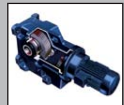
Falk™ Ultramite® Gearmotor and Gear Drive with UB Right Angle Helical Bevel

Ensure the highest operating performance for your car care conveyor by choosing Rexnord, your single source for car care conveying expertise, conveying chain, components and power transmission products.