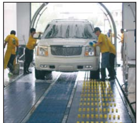
Rexnord 42 in wide 6999 Safety Top MatTop® chain with T1/T2 pushers in hand wash tunnels for ultimate safety in conveying cars and people